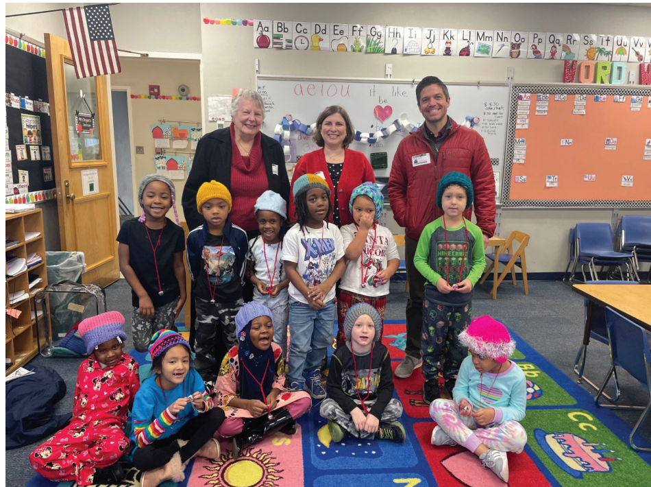
HIGHLAND PARK KNITTERS