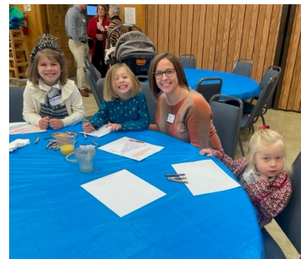
Photos from the annual pancake breakfast on Sunday, January 7.