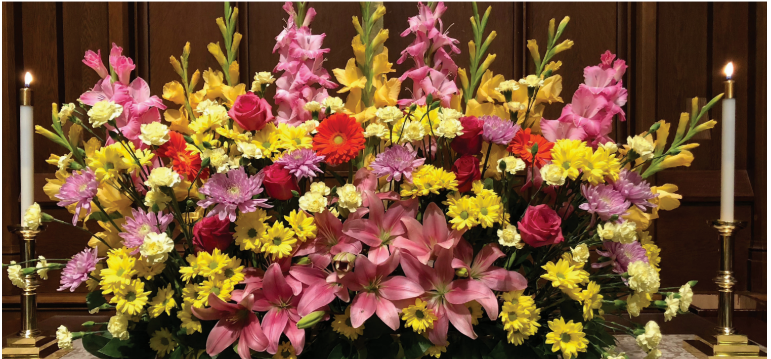
The floral arrangements in the sanctuary significantly enhance our Sunday worship experience. The April newsletter showcases various flower displays from the previous year.

Monthly Newsletter of Second Presbyterian Church