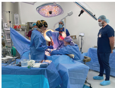
Moments from the Medical Mission Trip to the Dominican Republic, February 24 - March 2, 2024. We are grateful to all those who answered the call to serve!