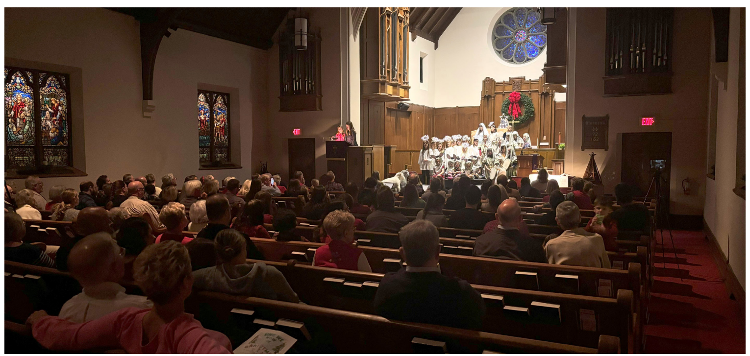
Church family enjoyed the traditional children's Christmas Pageant on Sunday, December 8, 2024.

Monthly Newsletter of Second Presbyterian Church