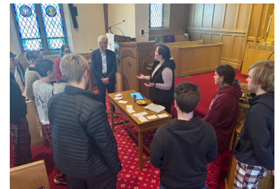
Photos rows 1 & 2 from Youth Sunday. Photos row 3 from the youth "Our Whole Lives" retreat.