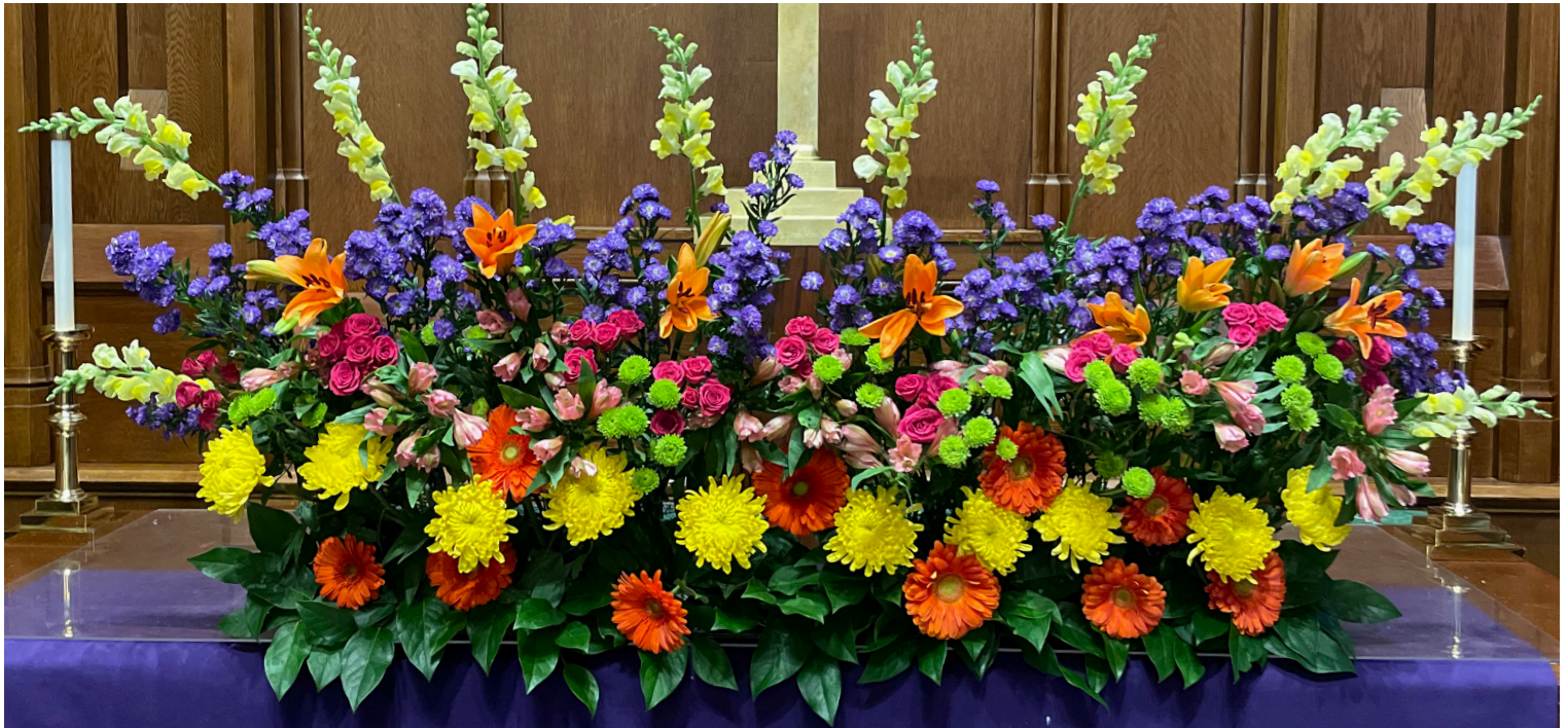
Floral arrangements in the sanctuary significantly enhance our Sunday worship experience. The April newsletter highlights flower displays from the past year. Learn more on p. 2.

Monthly Newsletter of Second Presbyterian Church