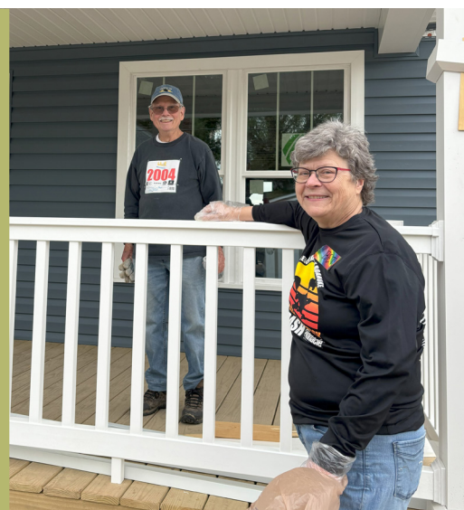
Photos from the 2024 Great Day of Service.